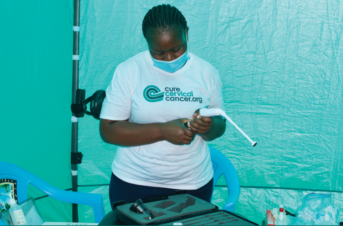
Healthcare professionals administer thermal ablation treatment to HPV+ patients in pop-up treatment tents (above). HPV self-samples are collected in pop-up privacy pods (below).